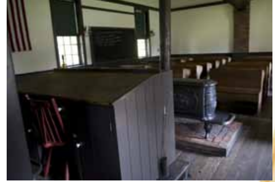
Interior of Scotch Settlement School, Greenfield Village