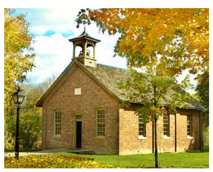
Scotch Settlement School, Greenfield Village

"Today children, please pull out your McGuffey Reader," Mr. Chapman said. I didn't mind the reader. In fact, I had already read ahead of the rest of the class. It was the spelling bee I wished we could skip. Maybe we will get too busy with the rest of our work to actually have the spelling be today, I thought.