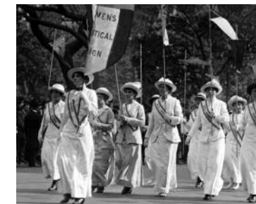
Women's Suffrage Parade in New York City, about 1915.