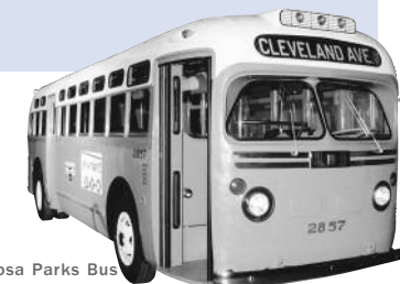
Rosa Parks Bus