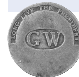
George Washington inaugural button, about 1789.