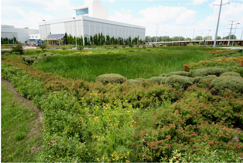
Wetlands and swales outside the Ford Rouge Visitor Center

Student responses on the post-activity discussion questions serve as the assessment for this lesson. Extension activities may also be used for evaluation purposes.