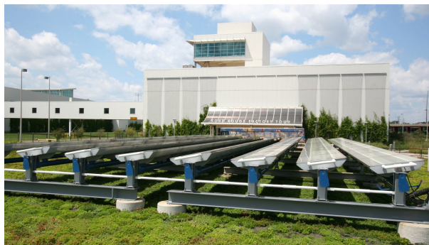
Solar panels in front of the Ford Rouge Visitor Center

Culminating Projects Student Activity Sheet #5A: Review/Assessment Questions Answer Key #5A