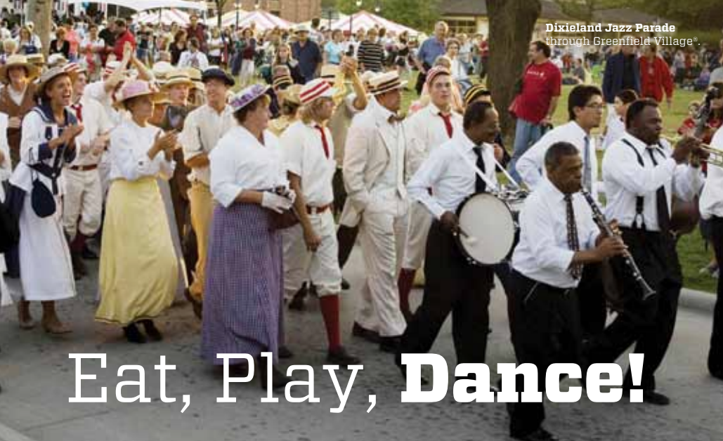
Dixieland Jazz Parade through Greenfield Village.