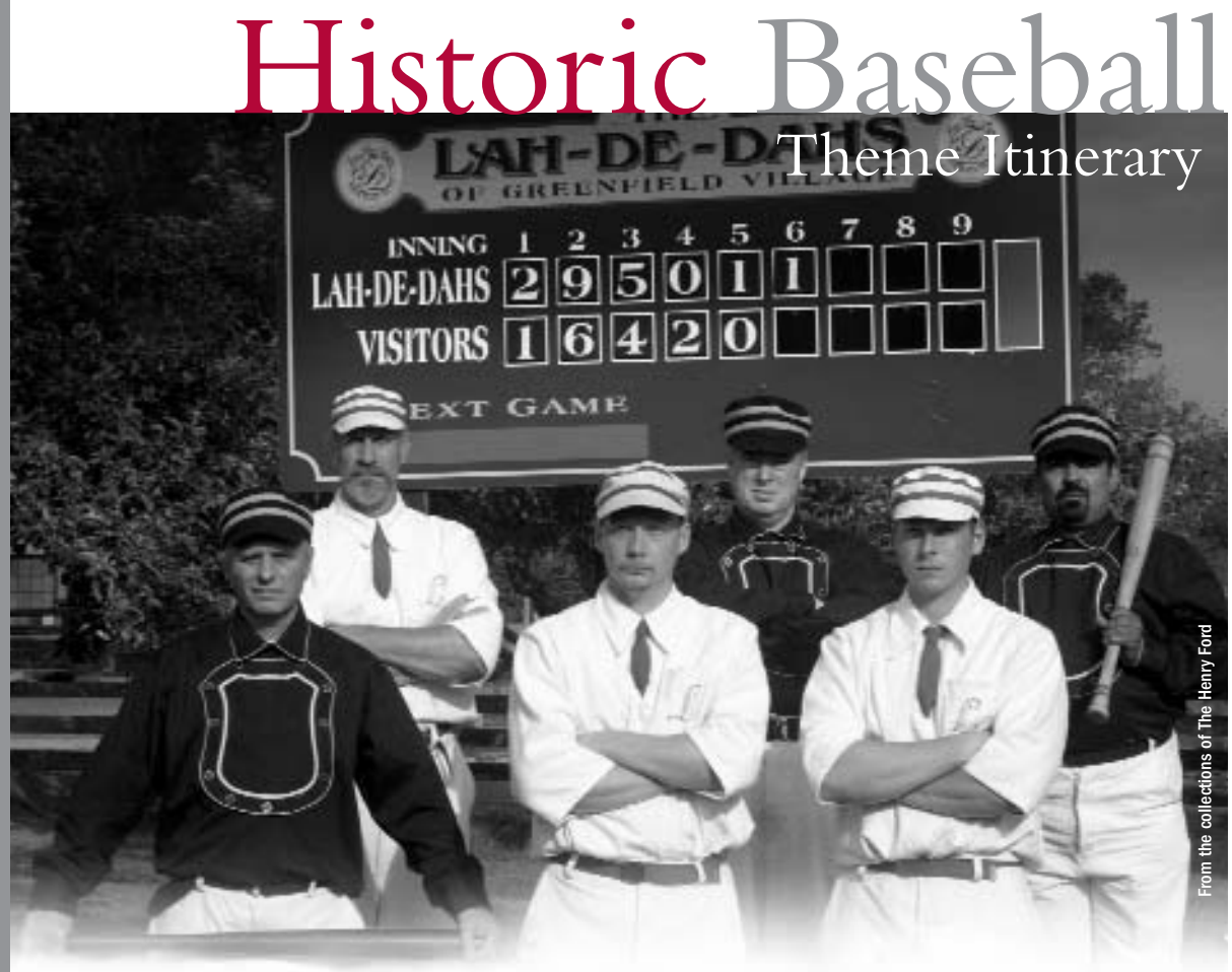
Historic Baseball teams, the Lah-De-Dahs and Nationals at Greenfield Village

America's favorite summer pastime has an exciting and colorful history—and we bring it all to you, live, at Greenfield Village.