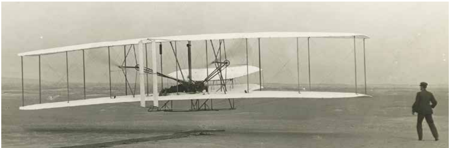
CLOCKWISE FROM TOP: Wright Cycle Shop, Original Site, Dayton, Ohio, circa 1910 - THF23103; Experimental Wright Glider Flying, 1900 - THF18159; Reproduction of Wright Brothers' Wind Tunnel Inside Wright Cycle Shop, Greenfield Village, 1938 - THF7810; First Flight of Wright Flyer at Kill Devil Hills, North Carolina, December 17, 1903 - THF81622.

I was created, at first, just as a model. I wasn't so happy to be that small, but at least I'm out. As a baby, they called me a glider. They built me from the funds of the cycle shop. Wind tunnels were very helpful when I took my first steps. Their theory on flying me like a kite was a little shaky at first. But it worked; I flew! As I was gliding through the clouds, I felt accomplished, free, and a little bit like a soaring eagle. I'm all grown up now; I changed my name to the Wright Flyer. I grew up, and now I'm bigger, more powerful.