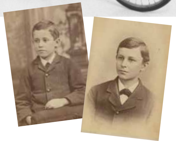
CLOCKWISE FROM TOP: Wright Home, Original Site, Dayton, Ohio, circa 1900 - THF37640; Wright Home Parlor Decorated for Christmas, Original Site, Dayton, Ohio, circa 1900 - THF23115; Van Cleve Bicycle, Made by the Wright Brothers circa 1896 - THF70569; Portrait of Orville Wright as a Boy, 1878 - THF22045; Portrait of Wilbur Wright as a Boy, 1878 - THF22044.