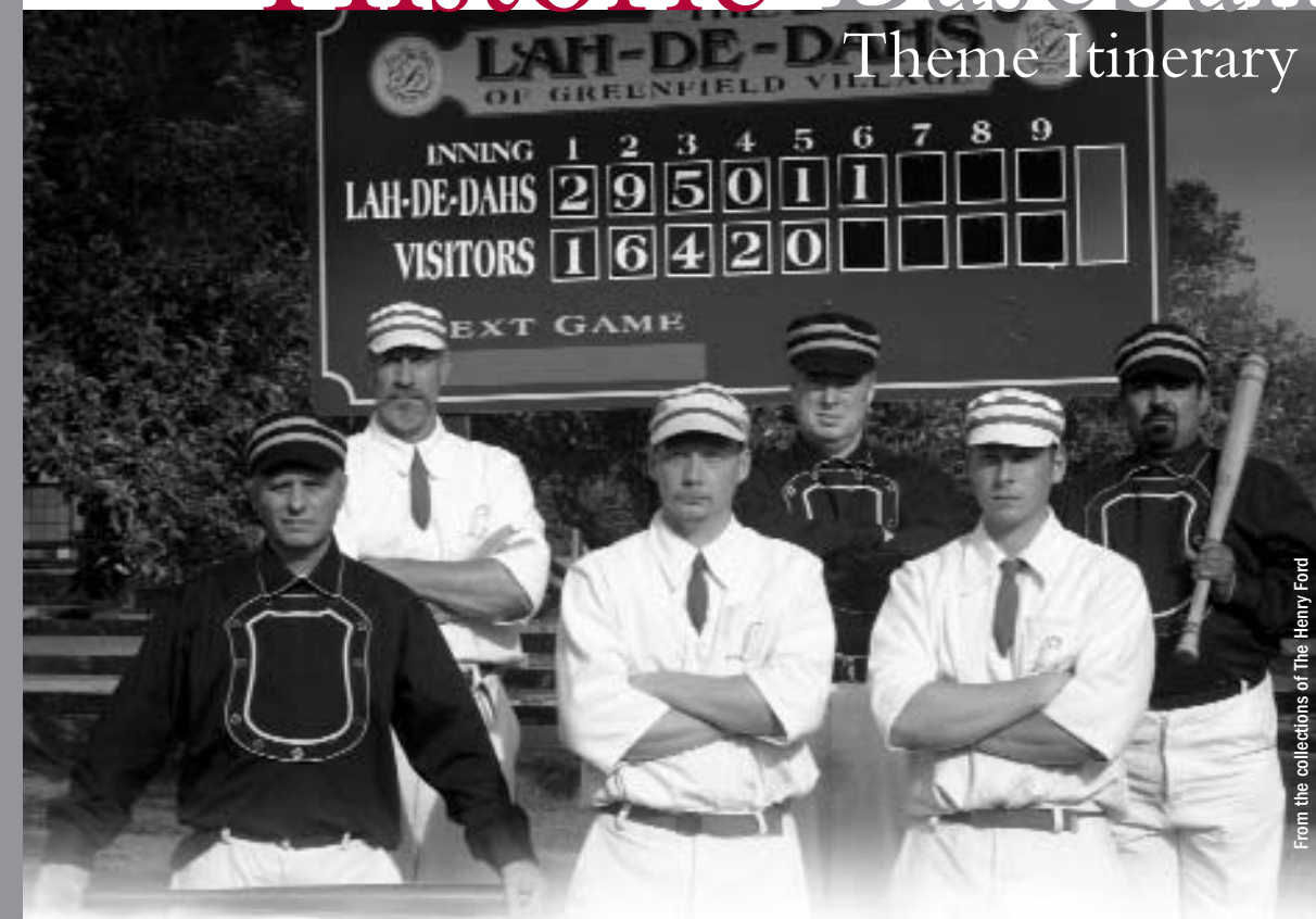
Historic Baseball teams, the Lah-De-Dahs and Nationals at Greenfield Village

America's favorite summer pastime has an exciting and colorful history—and we bring it all to you, live, at Greenfield Village.