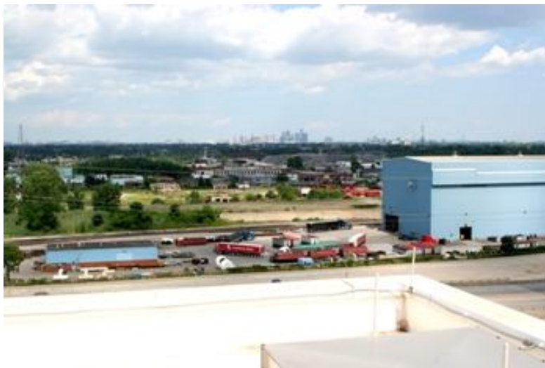
A view from the roof of the Ford Rouge Complex Visitors' Center looking out toward downtown Detroit.

Theme Sign Culminating Projects Student Activity Sheet #4A: Review/Assessment Questions Answer Key #4A