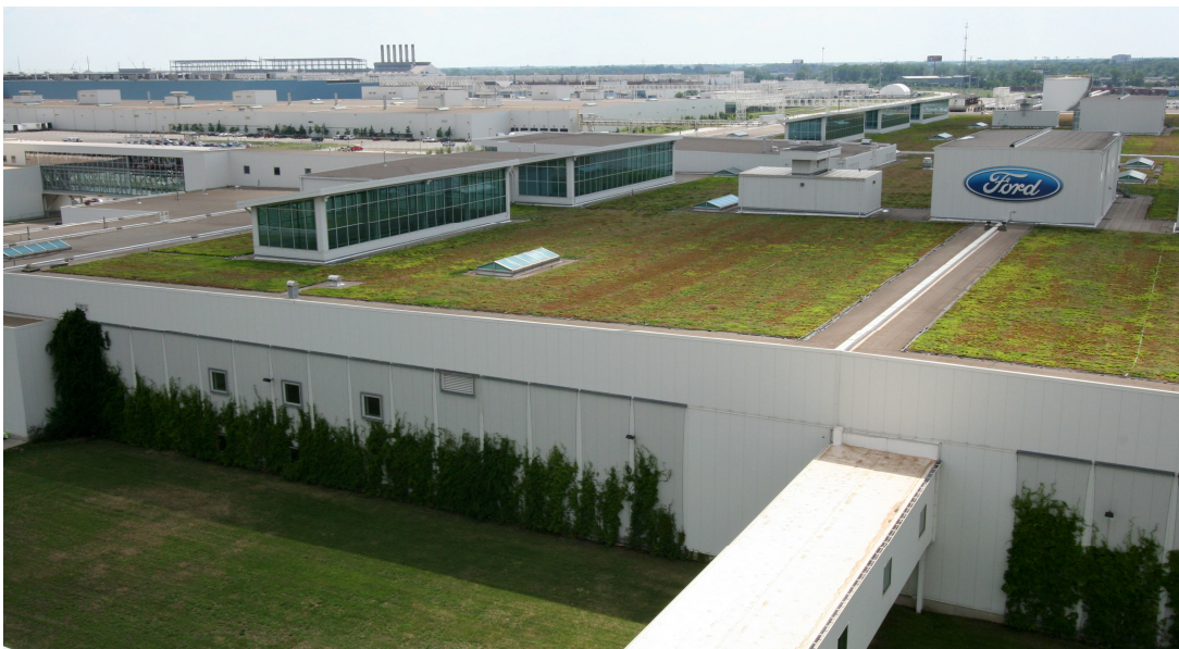
The world's largest green roof on the Dearborn Truck Plant

4. How could the innovations at the Ford Rouge Complex be implemented at your home or school on a smaller scale?