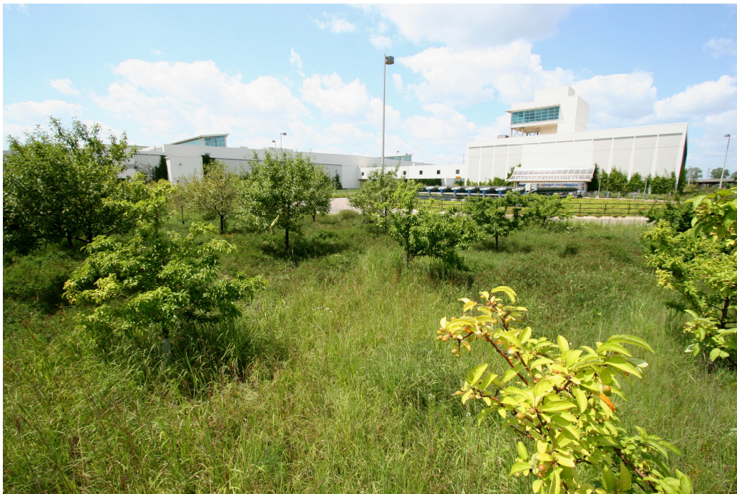
The Orchard at the Ford Rouge Complex

Student responses on the activity sheet, responses to discussion questions, and group presentation serve as the evaluation for this lesson. If desired, extension projects can be assigned for further assessment.