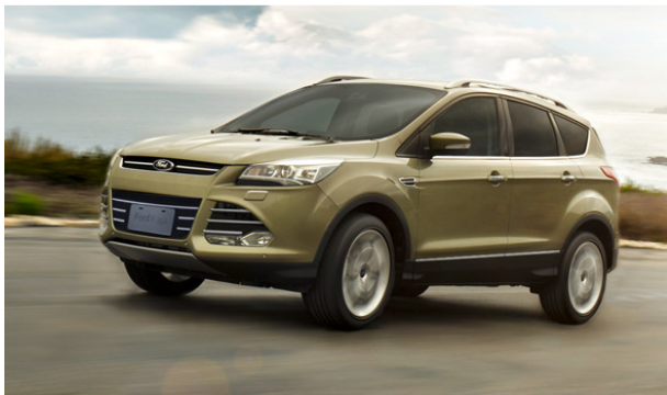
Figure 5: Ford Kuga 圖 5：福特 Kuga