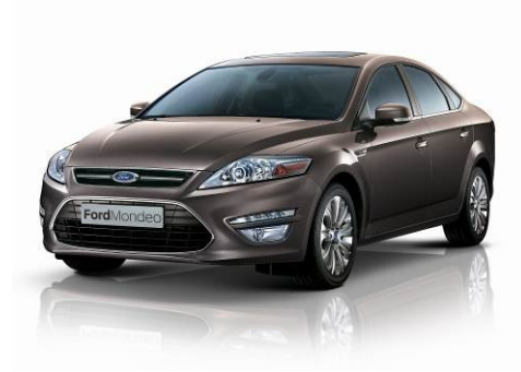
Figure 2: Ford Mondeo 圖 2：福特 Mondeo