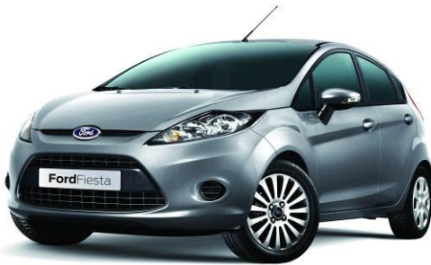
Figure 3: Ford Fiesta 圖 3：福特 Fiesta