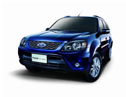
Figure 4: Ford Escape 圖 4：福特 Escape