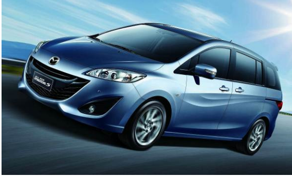
Figure 7: Mazda 5