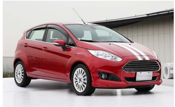
Figure 2: Ford Fiesta 圖 2：福特 Fiesta