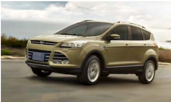
Figure 3: Ford Kuga 圖 3：福特 Kuga