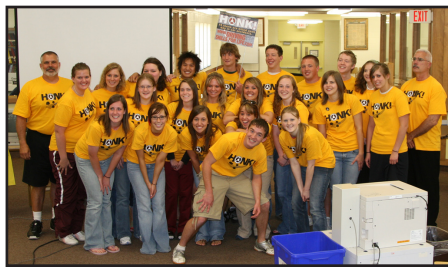
Tazewell County students from Morton High School present their teen-led safe driving campaigns.

"Ford's Driving Skills for Life program is delighted to partner with the State of Illinois in this important teen safety initiative