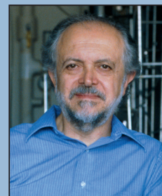
Chemist Mario J. Molina from the exhibition Our Journeys/Our Stories .

A tour schedule is available at the Smithsonian Institution Traveling Exhibition Service Web site at www.sites.si.edu .