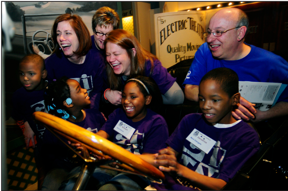
Students and staff of City Mission in Detroit have fun at The Henry Ford.