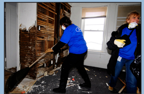
Ford volunteers do some serious clean-up as part of the Ford Volunteer Corps’ first Accelerated Action Day.