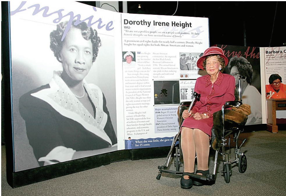
Dr. Dorothy Height