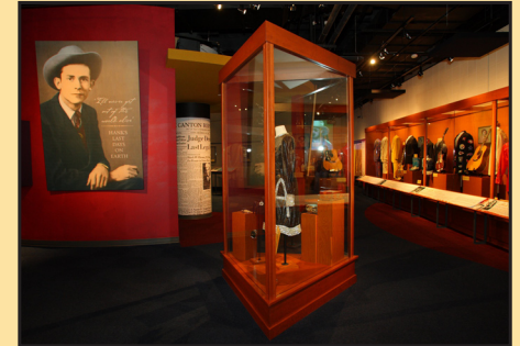
The Williams Family Legacy gallery.

Thousands of country music fans are being given a rare opportunity to take an intimate look at the lives, loves and birth of the pioneering music of the legendary Hank Williams and son Hank Williams Jr.