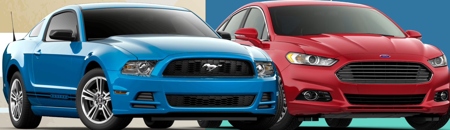
2013 Ford Mustang