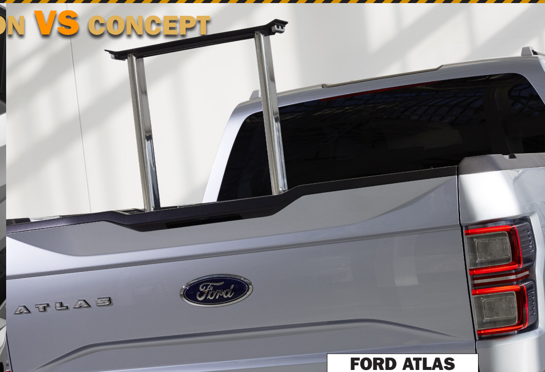
FORD ATLAS CONCEPT

Designers studied several options to provide maximum storage to customers with extra cargo needs. In one instance, designers looked at opening up the hallowed space within the walls of the tailgate for added storage space, possibly to carry a tool set and a first-aid kit.