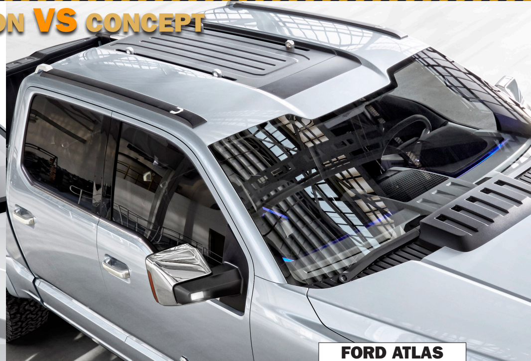
FORD ATLAS CONCEPT

Early sketches show an extended windshield that continues onto the roof. The design is unique in that the windshield forks over the heads of the driver and passenger, giving a moonroof feel without losing a durable surface used for securing extra-large cargo. While a very stylish point, it ultimately was dropped to provide a more practical integrated roof carrying system to secure large cargo.