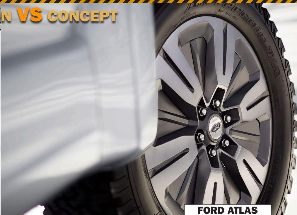
FORD ATLAS CONCEPT

The wheels came down to aerodynamics. Fuel efficiency is critical to this customer, so designers analyzed possible solutions, including complete surface wheels. That design, while practical, is not a match for the Atlas, so new solutions were developed, ultimately leading to the Active Wheel Shutters that automatically hide to improve style when the truck is parked or traveling at low speeds. When the vehicle hits the highway, the shutters automatically close to improve aerodynamics.