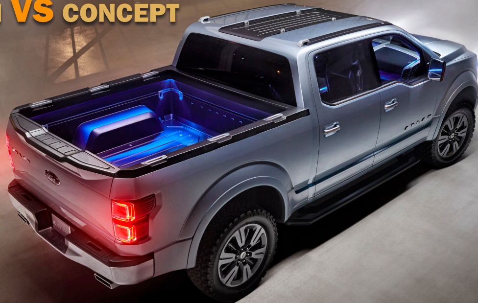
FORD ATLAS CONCEPT

Sometimes work starts before the sun comes up and keeps going after it gets dark. Ford wanted a truck that would suit the pace of such a lifestyle, so to provide customers with the best working solution designers studied different lighting options, including lights from the top of the cab. Ultimately, it was decided lights from within the bed would better illuminate cargo. The result: A high-tech-looking truck bed that lights up from inside its own walls.