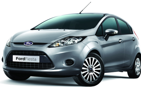
Figure 3: Ford Fiesta 圖 3：福特 Fiesta