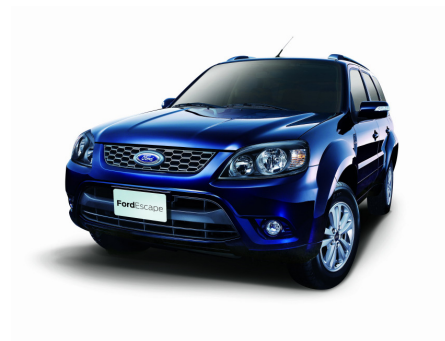
Figure 4: Ford Escape 圖 4：福特 Escape