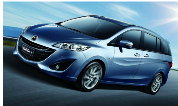
Figure 6: Mazda 5 圖 6 : Mazda 5