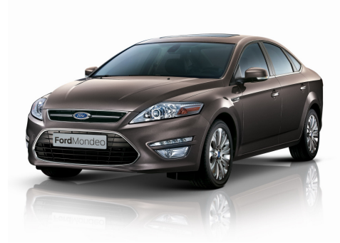
Figure 2: Ford Mondeo 圖 2：福特 Mondeo