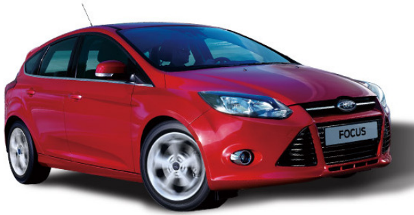
Figure 1: Ford Focus 圖 1：福特 Focus