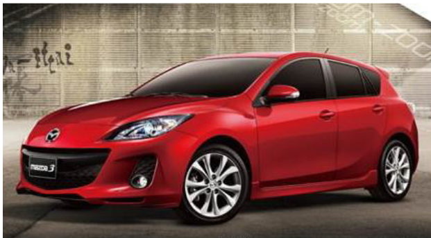
Figure 5: Mazda 3 圖 5：Mazda 3