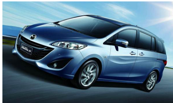
Figure 6: Mazda 5 圖 6：Mazda 5