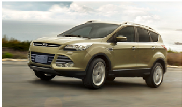
Figure 4: Ford Kuga 圖 4：福特 Kuga