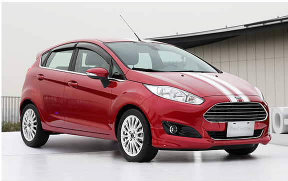
Figure 3: Ford Fiesta 圖 3：福特 Fiesta