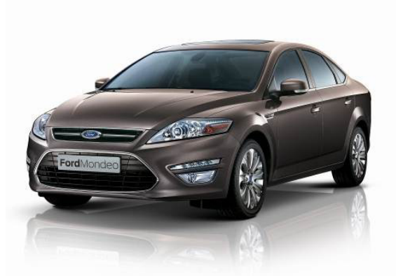
Figure 2: Ford Mondeo 圖 2：福特 Mondeo