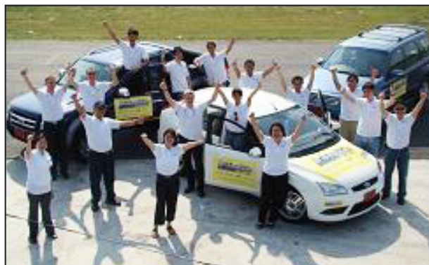
Ford personnel from the ASEAN region celebrate completing "a train the trainer" session in preparation for the regional launch of Driving Skills for Life.

The program is supported by the Vietnam government's National Traffic Safety Committee and has been customized for Vietnam to reflect the local driving environment and road conditions. Training will be offered through a series of events open to the public.