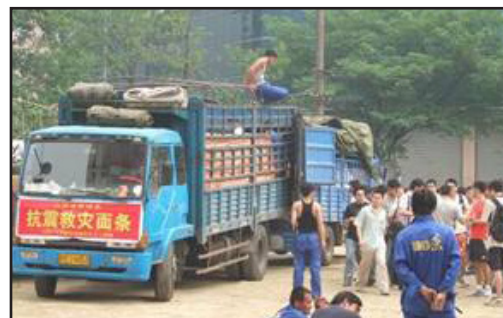
Donations from all over the country were transported to the affected areas.