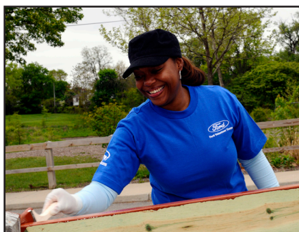
...and adding a coat of paint in Dearborn.