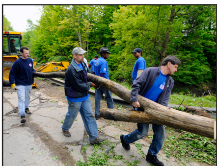
Pitching in at the Rouge River clean up...

Visit www.volunteer.ford.com for more information.