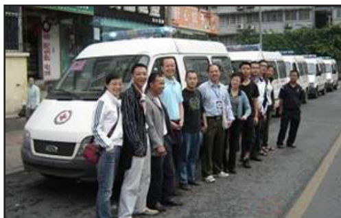
Seven Ford Transits donated by Ford Motor China were modified into ambulances overnight on May 16.

In Burma, Ford Fund pledged $50,000, despite the fact that Ford does not have operations there, to support the delivery of basic relief, such as clean drinking water, food, shelter as well as rebuilding of basic infrastructure.