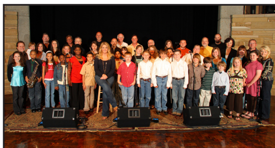
Trisha Yearwood with Words & Music Night performers.

Some special newcomers to the music scene took to the stage at Nashville's Country Music Hall of Fame and Museum in May.