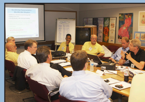
Members of the Ford team welcome two Master Trainers from Germany and Driving Skills for Life Instructors for eco-driving training in Dearborn.

Recently DSFL driving instructors hit the books and took an accelerated course on eco-driving. The training was done by two "Master Trainers" from the German Road Safety Council, which has significantly helped Germany reduce fatal traffic accidents over the past 30-plus years. The DSFL drivers were schooled on proven driving methods and habits that can help improve fuel economy, safety and environmental preservation. Tips learned through the initiative will be added to the DSFL curriculum.