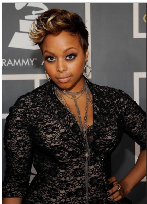
Grammy Winner Chrisette Michele

Michele, the 2009 Grammy winner for Best Urban/Alternative Performance, visited the school as part of GRAMMY Career Day, a program supported by Ford Fund that helps high school students gain career insights into the music industry.