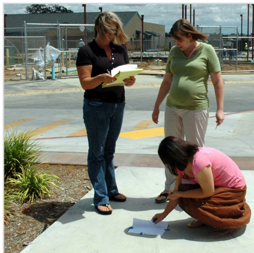
Educators become familiar with aspects of the Working Toward Sustainability program.

“What makes our approach unique is that we are stepping beyond making just our manufacturing processes and products greener. We are also trying to create a future workforce that cares about the environment and has the skill set to make a difference.”