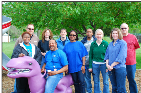
Volunteers spruce up the Penrickton Center for Blind Children.