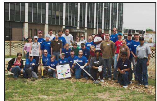
Getting ready to build an urban garden for the Coalition on Temporary Shelter (COTS).