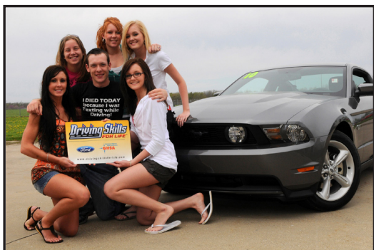
Ford Driving Skills For Life puts teens behind the wheel to become safer, more experienced drivers.

The ride-and-drives were the big prize in the statewide Ford Fund-supported 2008 Operation Teen Safe Driving program, which gave 96 Illinois high schools $1,000 grants to create innovative and unique teen-led safe driving campaigns.