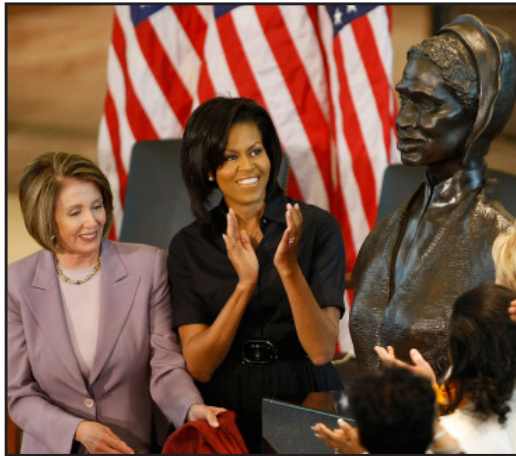
First Lady Michelle Obama is among those present at the unveiling of the Sojourner Truth memorial.

The Sojourner Truth Memorial Fund was organized by the National Congress of Black Women. Ford Fund's involvement was inspired by the Freedom's Sisters travelling exhibition, which Ford Fund launched in 2008.