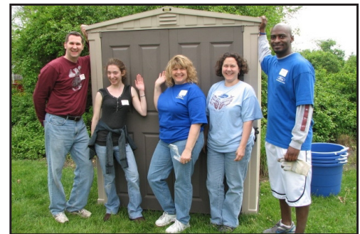
Volunteers help create a public educational enrichment garden for the Detroit Zoological Society.