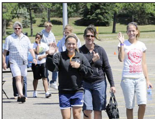
Students arrive at the Ford DSFL drive camp.