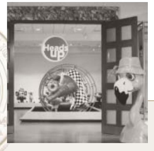
Heads Up! showcased decades of vintage parade heads in the Museum Gallery.

U.S. Mint coin commemorates the 125th anniversary of the light bulb.