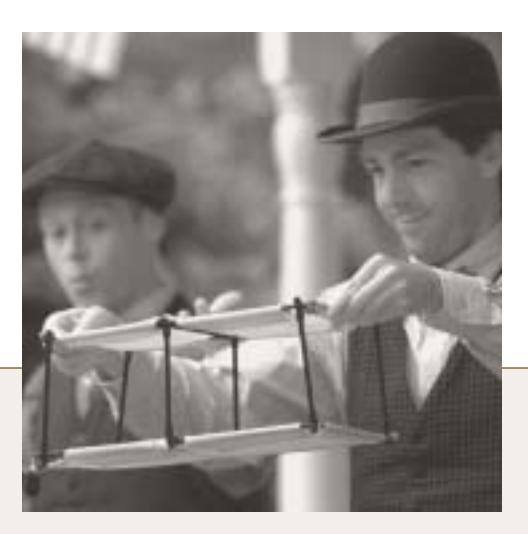
The accomplishments of the Wright brothers serve as a basis for a unique educational experience.