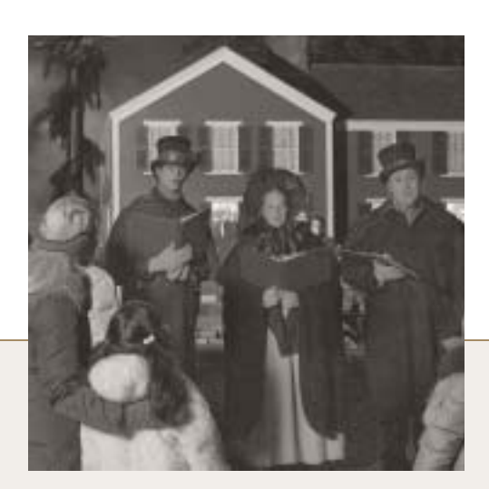
Carolers in period costumes sing throughout the Village.