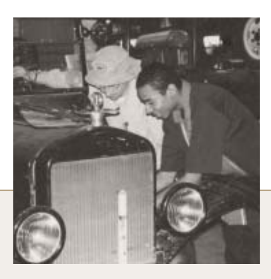
YMP students learn valuable skills while working side by side with their mentor.