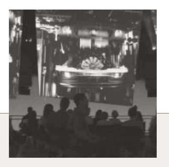
The Art of Manufacturing Theater presents a multisensory experience of the Rouge factory.