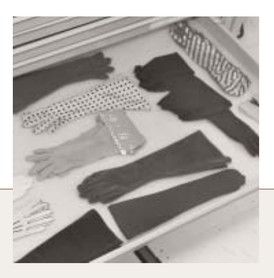
Thousands of artifacts are stored in new controlled environments in Benson Ford Research Center .