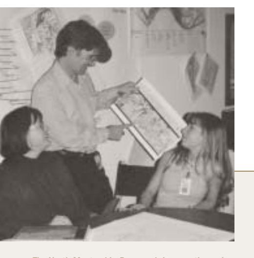
The Youth Mentorship Program brings youths and adults together for a mutually beneficial experience.

*Name changed to protect student privacy.