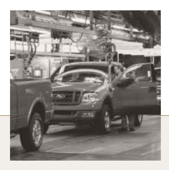
Part of the Ford Rouge Factory Tour, F-150s in production go down the assembly line.