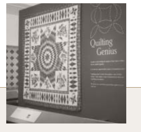
The Museum Gallery is host to Quilting Genius and other special exhibits of the collections of The Henry Ford .