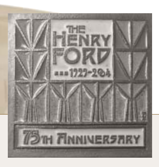
Commemorative tiles made by Greenfield Village artisans celebrate our 75th anniversary.

The past and the present merge beautifully with a limited-edition tile commemorating The Henry Ford's 75th anniversary. The design was inspired by the American Arts & Craft movement and brought to life using modern computer technology. Each tile was hand-made in the Pottery Shop by Village potters using traditional production techniques.