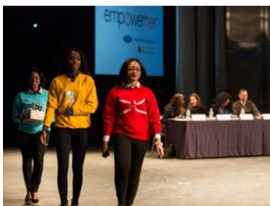
EmpowerHER pitch competition