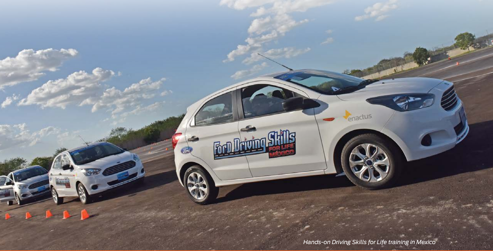
Hands-on Driving Skills for Life training in Mexico