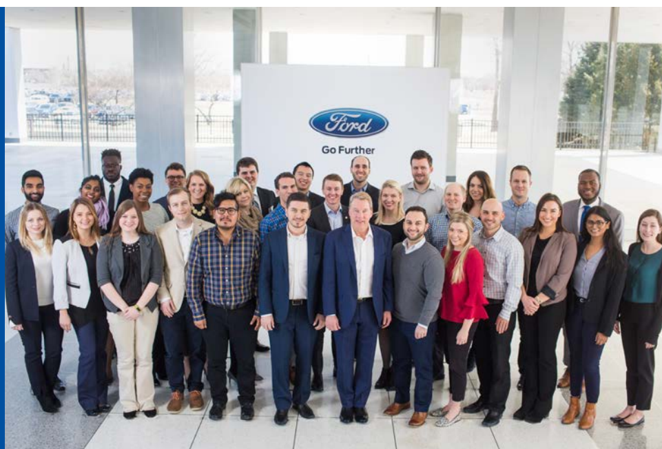
2018 Thirty Under 30 Class with Bill Ford

The third class of Thirty Under 30 fellows focused their work on housing, homelessness and shelter initiatives. Launched in 2016, the program works to further develop the philanthropic leadership skills of 30 young employees. Thirty Under 30 benefited communities in Canada for the first time in 2018 when a team of fellows focused their work on helping the United Way of Halton and Hamilton, both in Ontario.