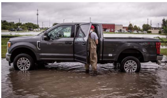
Ford Fund matched employee and dealer contributions to support Team Rubicon's relief efforts for Hurricanes Florence and Michael.

In Houston, Ford and Ford Fund donated 38 vehicles to eight organizations supporting ongoing recovery efforts in Southeast Texas following Hurricane Harvey. Ford Fund also collaborated with the Congressional Black Caucus Foundation to honor 27 individuals with a Ford Freedom Unsung Heroes of Harvey award in recognition of their heroic contributions to their community during hurricane relief efforts in 2017.