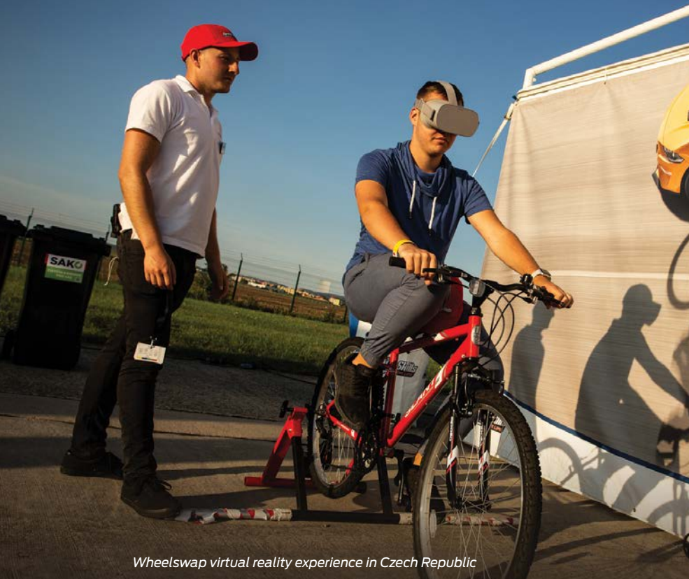
Wheelswap virtual reality experience in Czech Republic