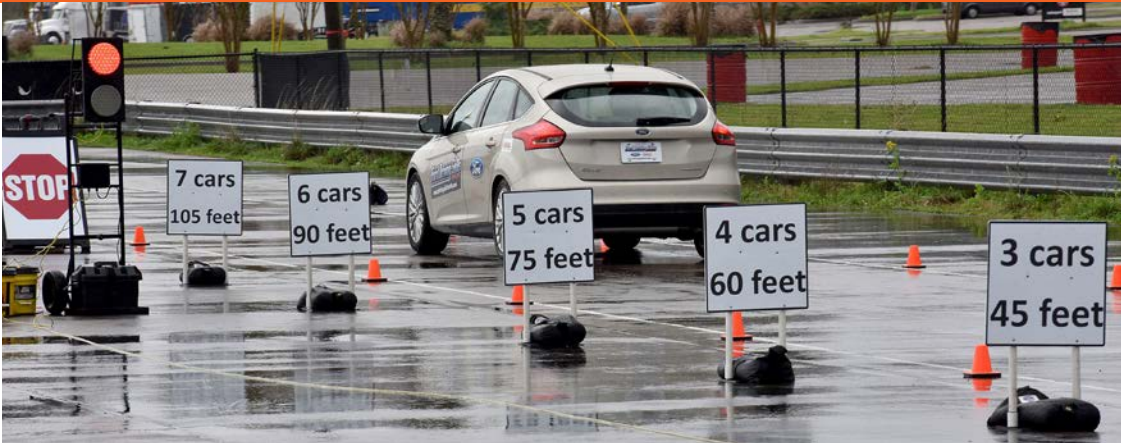
Hazard recognition and anti lock braking exercise

Ford Driving Skills for Life's hands-on training is fully customizable to each country for cultural differences, laws and infrastructure. In India, the program talks about honking your horn and how increased noise levels interfere with emergency vehicle sirens. In other countries, drivers are taught not to overload their vehicles with people or possessions.