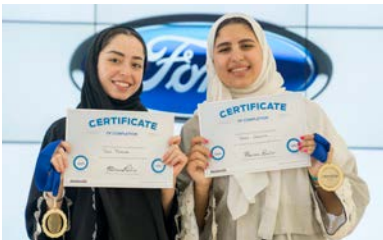
Driving Skills for Life for Her in Saudi Arabia