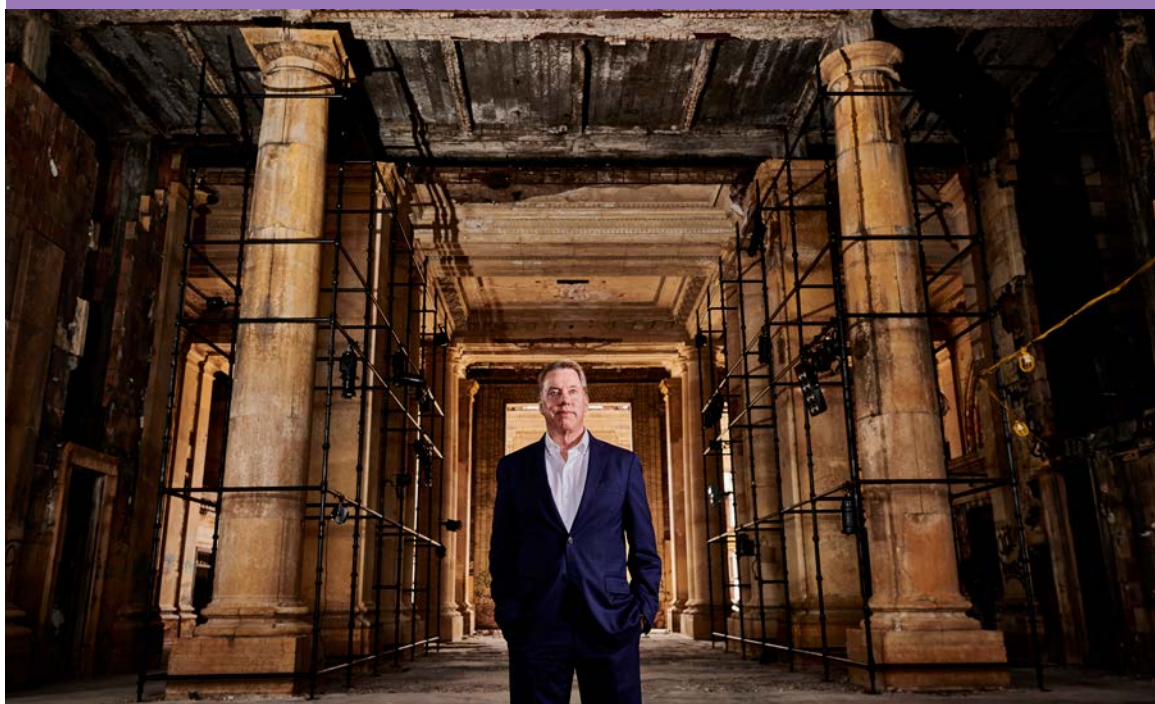
Bill Ford, executive chairman, Ford Motor Company at Michigan Central Station

When Ford announced our purchase of Michigan Central Station in June 2018 as the centerpiece of a 1.2-million-square-foot innovation campus in Corktown, we promised to “create tomorrow, together.” This means we want the community actively involved in making our Corktown campus the next great anchor of Detroit’s comeback. In addition to a launchpad for Ford’s new mobility solutions, we are just as committed to creating vibrant, inclusive spaces for local entrepreneurs and families. The project will bring approximately 2,500 Ford employees to Corktown and 2,500 jobs with Ford’s partners and suppliers who will help us define the future of transportation. Ford Fund and Ford Volunteer Corps have been active in Corktown and the surrounding Southwest Detroit neighborhood for years. As Ford deepens its roots in the area, we are playing a lead role in engaging the community and ensuring the company is a strong local partner.