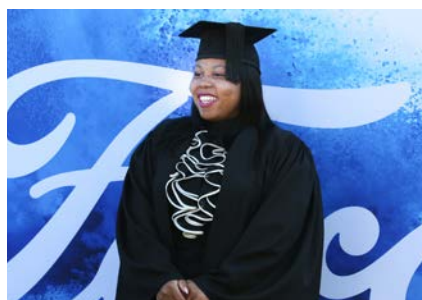
Ford Resource and Engagement Center graduation ceremony in Pretoria, South Africa