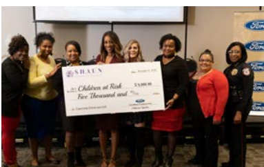
S.H.A.U.N. Foundation for Girls