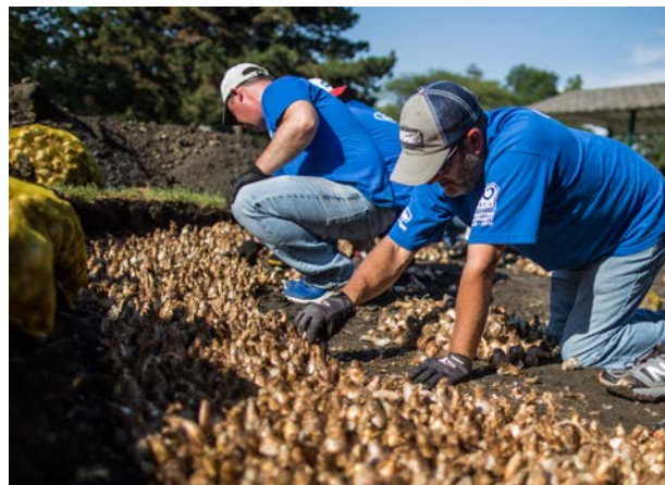
Employees planting daffodils on Belle Isle in Detroit