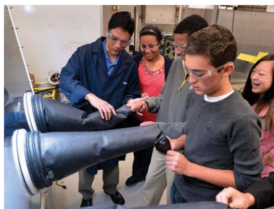
Next Generation Learning students visit Ford Research and Innovation Center