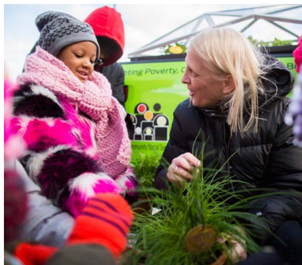
Ford Mobile Food Farm

Bill Ford Better World Challenge continued to inspire Ford employees to find new ways to improve the daily lives of people across the globe by addressing issues of mobility and scarcity of food, clean water and shelter. Last year, Ford volunteers joined in completing the installation of 1,000 toilets in homes and public facilities in three rural villages in India, near Ford's Chennai plant. The improvements will help reduce disease and child mortality rates while improving hygiene and restoring dignity. A community center was built in Guayacan, Mexico, near Ford's Hermosillo plant. The center is providing 750 families with access to uncontaminated water and flushing toilets. We also launched the Ford Mobile Food Farm, an indoor farming and educational program that is delivering fresh produce to Detroit area residents and restaurants year-round.