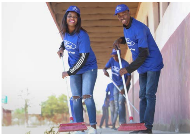
Pretoria, South Africa

In the United Kingdom, Ford employees ran coding classes for primary school children to bring design and technology to life in a fun and engaging way – one of dozens of projects that took place in April as part of the second-annual Vibrant Volunteer Week throughout Europe.