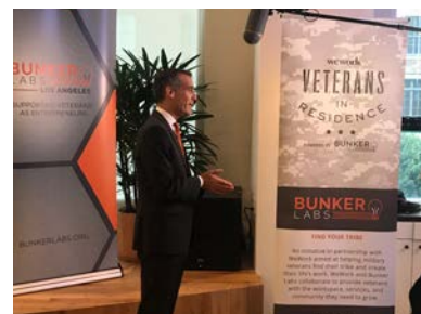
Bunker Labs competition in Los Angeles