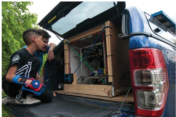
Argentina Limbs Project with Atomic Lab