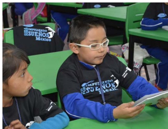
Ford Driving Dreams Mexico

Ford Next Generation Learning career academies continued to work with communities to develop future scientists, entrepreneurs and inventors who will help make the world a better place for years to come. In 2018, Ford Fund awarded $50,000 to student-led projects aimed at addressing community challenges as part of the third annual Ford Next Generation Learning STEAM High School Community Challenge . Students at the Academy of Information Technology and Robotics at Spruce Creek High School in Volusia County, Florida, won the $20,000 grand prize for developing a smartphone application that allows people affected by natural disaster to communicate with emergency responders even when there is no internet or cellular service. The Utica Center for Science and Industry in Sterling Heights, Michigan, won the $10,000 prize, while four additional teams received $5,000 each for their innovations.