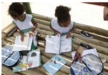
Brazil backpack program