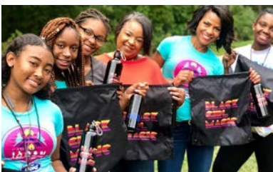
Rhonda Walker Foundation