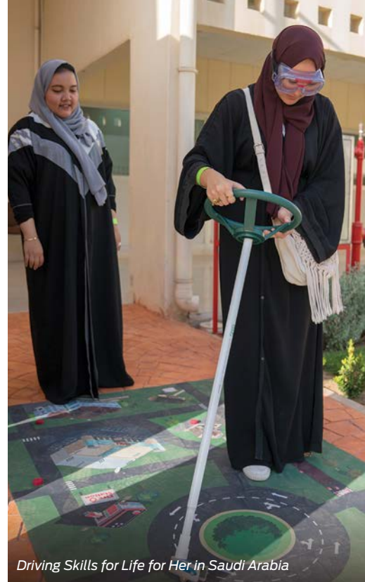
Driving Skills for Life for Her in Saudi Arabia

2018 marked the lifting of a royal decree in Saudi Arabia banning women from obtaining a driver's license. To help Saudi women build confidence behind the wheel, Ford launched a customized introductory program – Ford Driving Skills for Life for Her – at Effat University in Jeddah, Saudi Arabia. More than 250 students were trained on the makeup of a vehicle, distraction, impairment and braking.