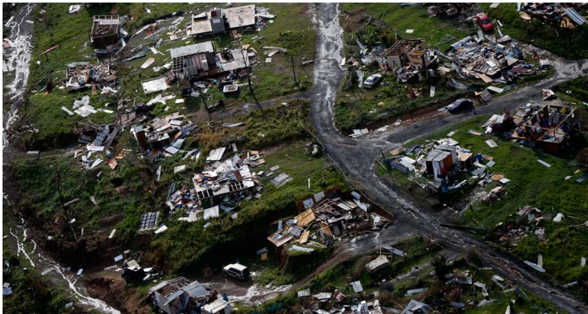
Destroyed communities are seen in the aftermath of Hurricane Maria in Toa Alta, Puerto Rico.

In 2018, Ford Fund again held its Ford Disaster Relief Mobility Challenge . The program awarded four U.S. nonprofits a $70,000 grant each to purchase and customize a Ford Transit cargo or passenger van to help meet specific needs of their communities in preparing for or responding to natural disasters. Winners include: