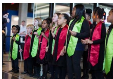
Detroit Children's Choir at Ford World Headquarters