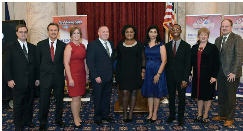
Driving Skills for Life Unsung Heroes of Highway Safety

In Europe, the team debuted a new Wheelswap virtual reality experience as part of its new Share the Road campaign, allowing participants to see the road from the perspective of cyclists. The training, which seeks to encourage greater empathy among different types of road users, was used in multiple countries around the world last year.