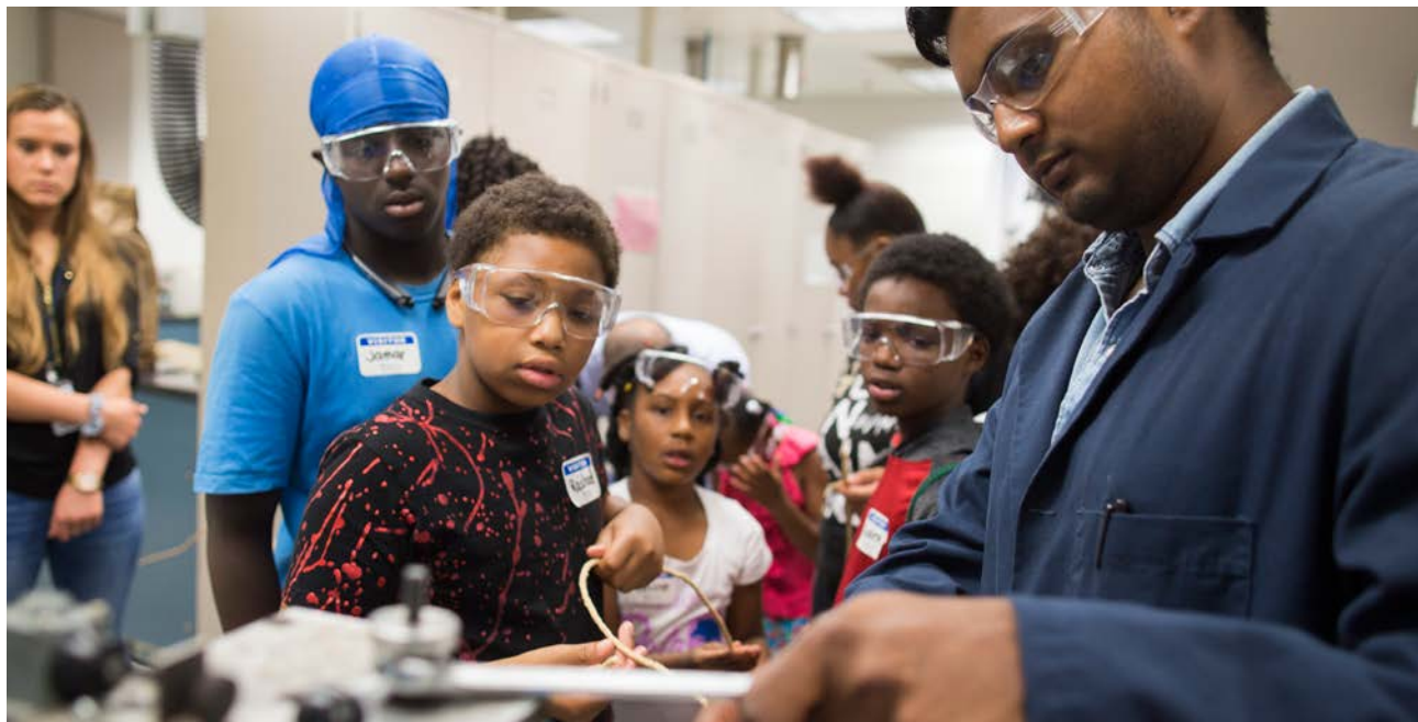
Detroit students learn from Ford engineer

Since 2012, Ford Driving Dreams has been supporting students in underserved communities across the United States, Puerto Rico and Latin America – inspiring them to achieve academic success via scholarships and motivational programs that encourage them to stay in school and continue to college. In 2018, the program expanded to Orlando, Florida, and reached a milestone when it launched in Mexico City, partnering with the Ford Dealers Civic Committee to support the nearly 200 Ford schools they have built across Mexico.