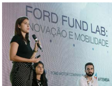
Ford Fund mobility lab in Brazil