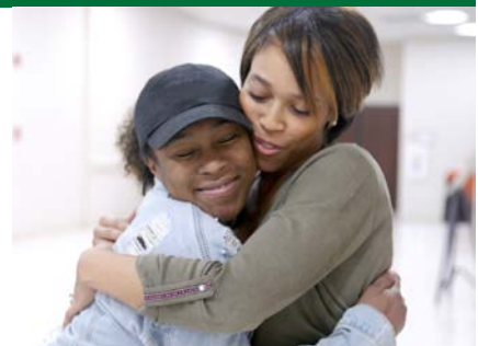
Ford First Gen at Spelman College

Ford First Gen at Spelman College was launched in 2018 to help improve college graduation rates among first-generation students. The program pairs 55 first-generation students in their first year with 10 juniors – also first-generation students – who serve as peer mentors. Students attend monthly seminars focused on networking, career development and building healthy relationships – all designed to help them succeed throughout their four years in college. They meet with industry professionals for insight into today's workplace, work with Spelman faculty and complete Ford-sponsored summer internships. The program at Spelman College is the latest in Ford Fund's decades-long commitment to supporting Historically Black Colleges and Universities and the students who attend them.