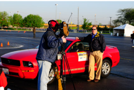
May 13, 2008 - MSNBC's Today Show reporter Phil LeBeau reports live from the Driving Skills for Life Ride & Drive at US Cellular field in Chicago